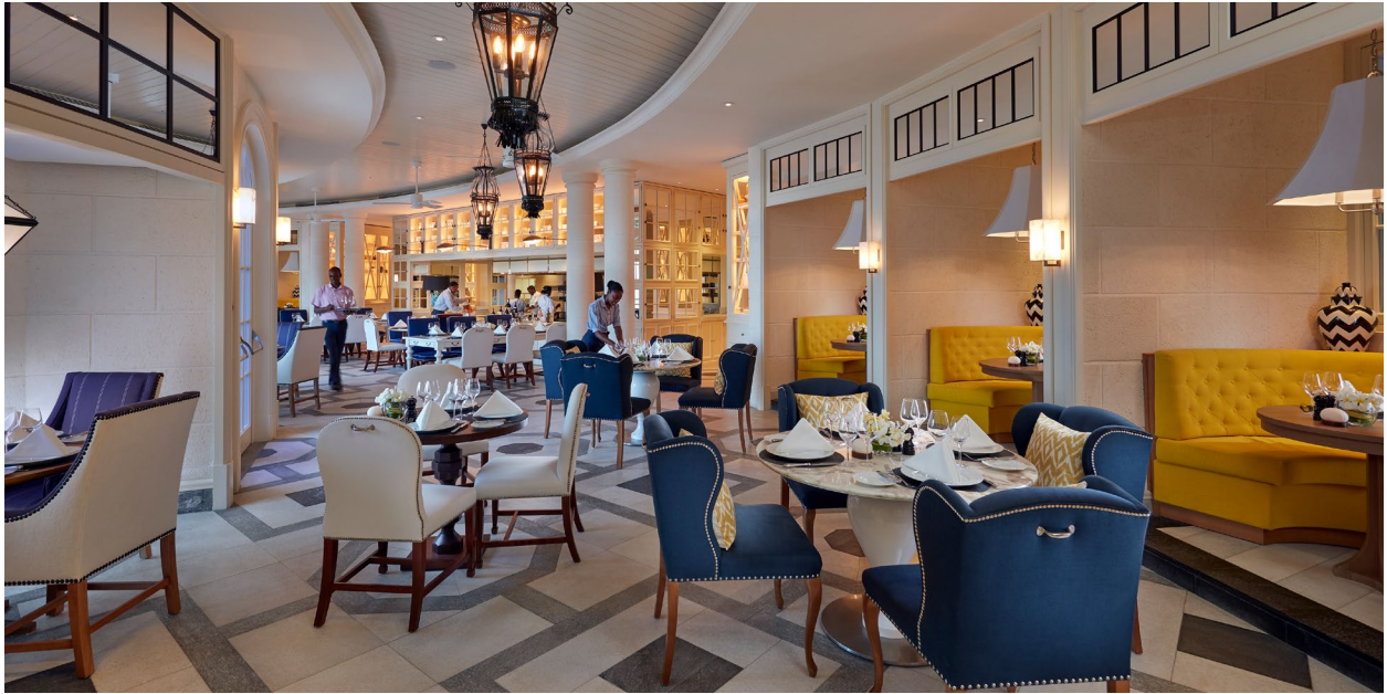
Asianne Restaurant Available for events for up to 80 guests