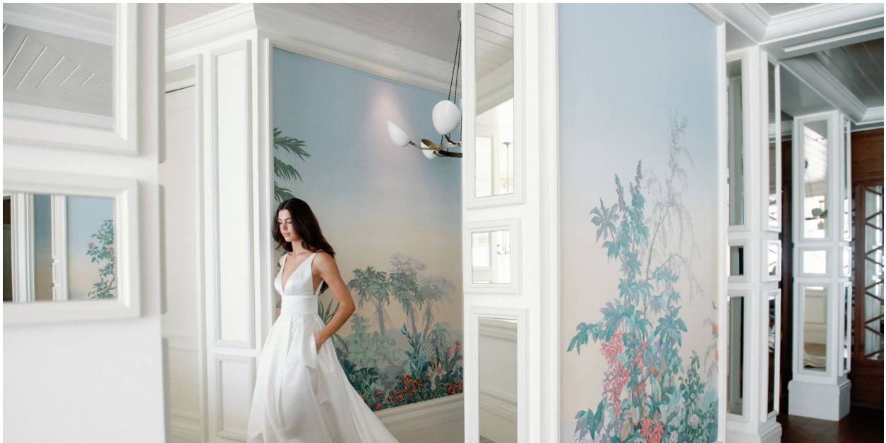
Tides Bar + Grill Available for events for up to 60 guests