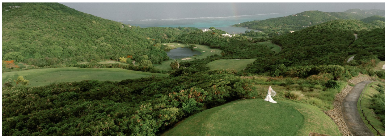
Signature Hole at Golf Course

Available for cocktail hour and ceremonies for up to 20 guests