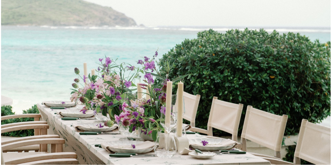
Lagoon Cafe Available for events for up to 38 guests