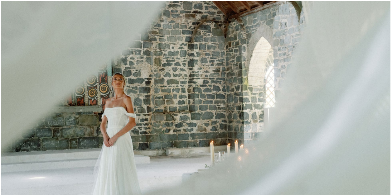
17th Century Church Available for ceremonies for up to 80 guests